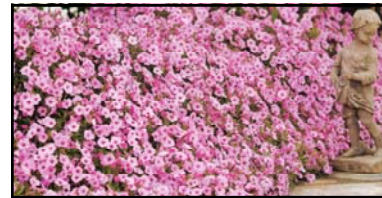
(Above) A wall of the Supertunia “Bubblegum” that proved to be the most spectacular in Butte’s 183 hanging street baskets.