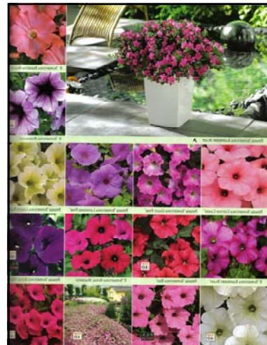
(Right) Some of the “Supertunia” color series. Look for varieties that are listed as “mounding” and “spreading”, not just mounding since those will not overflow a container or border.