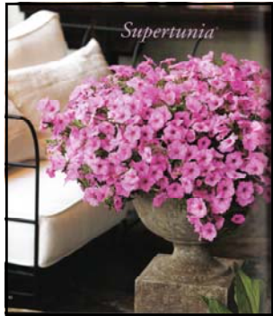
(Left) An example of two “Supertunia” plants in a 16” container

And remember not to use regular garden soil in a container. It is too heavy. Instead use light potting or moisture retaining soil. Ideally, fertilize every watering day with a diluted water soluble fertilizer when you water. Miracle-Gro is what most people use, and it is acceptable because it is safe. Instead, many professional greenhouses use other brands of water soluble fertilizers such as Masterblend. A professional greenhouse may often sell you a household amount of a professional fertilizer. Unless you really know your plants, avoid purchasing your container petunias at a box store since both the plants are not clearly identifiable and the help is clueless. You may or may not pay more for a plant from a professional nursery person, but the superior quality of the plant and the available expertise makes it well worth any small added expense.